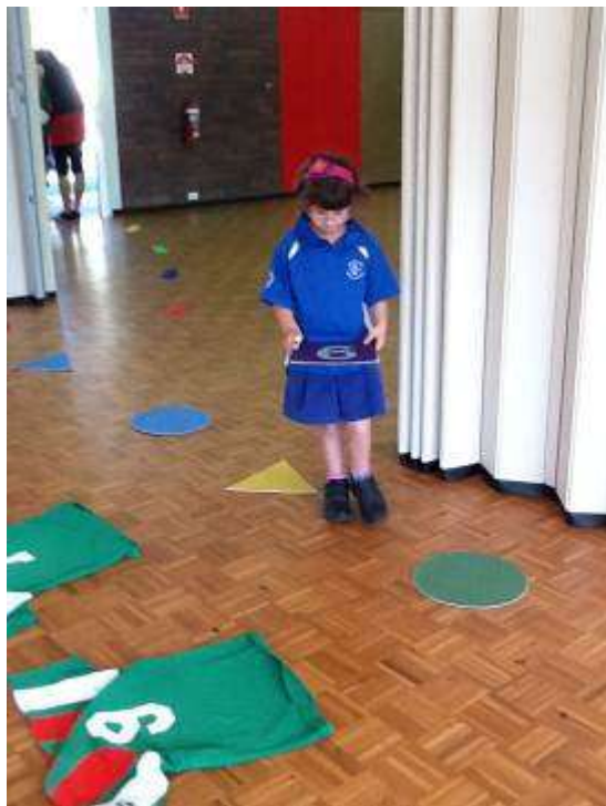
Numeracy in action in a soccer lesson...Jordan is matching her numbered mat to the soccer shirt she wears for the lesson!